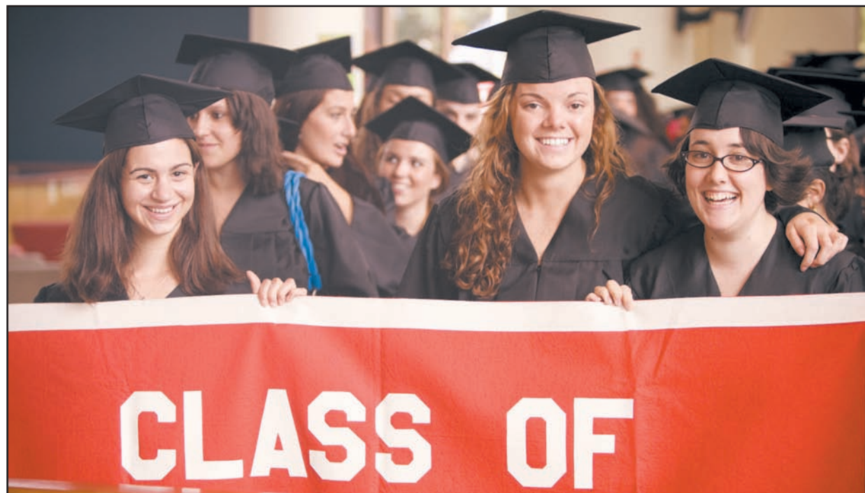
Emmanuel officially opened its 90 th year with Academic Convocation on September 9 th .