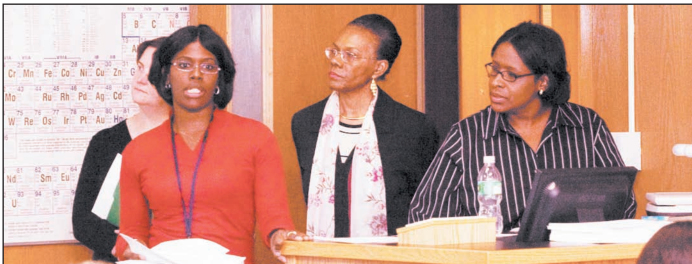
Professionals within the Graduate Certificate in Research Administration program present their work during a recent class session.