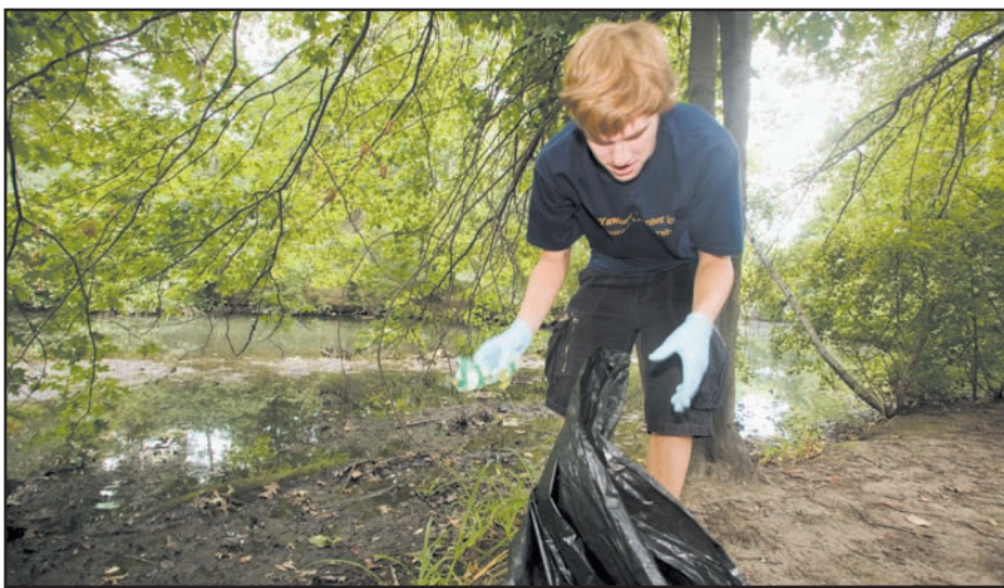
Students had nine different service sites to choose from during the College's Annual Day of Service, including clean up at the Muddy River.

"The day went very well, students came out in big numbers again this