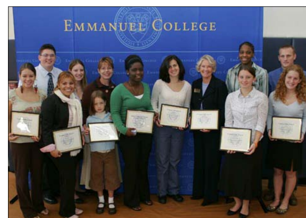
Campus Life Award recipients