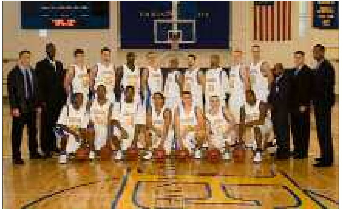
The 2005-2006 Men's Basketball Team