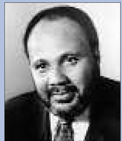
Martin Luther King, III

Martin Luther King, III is the eldest son of Martin Luther King, Jr. and Coretta Scott King and has established himself as a community activist and a political leader with his active involvement in policy initiatives to maintain the fair and equitable treatment of all citizens. His work is global, with his mission of non-violent conflict resolution taking him to numerous nations throughout Africa, Europe and Asia.