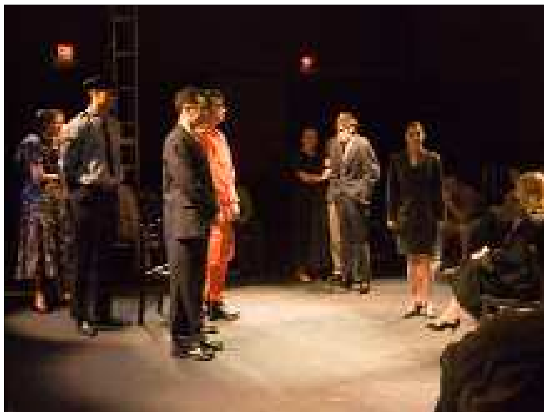
The cast of “Dead Man Walking”