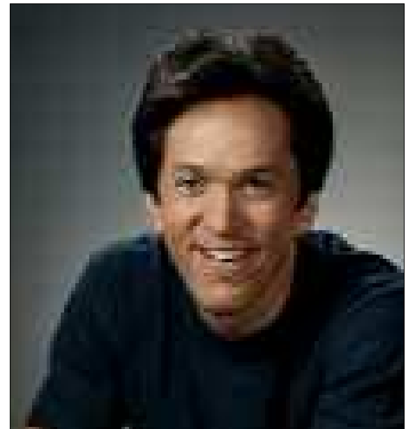
Tuesdays with Morrie author Mitch Albom

"The Dream Fund" promotes the arts for children and "A Time to Help" organizes volunteers to staff shelters, build homes, participate in meals-on-wheels, and more in the city. A native of Philadelphia, Mr. Albom is a graduate of Brandeis University with master's degrees in journalism and business administration from Columbia University.