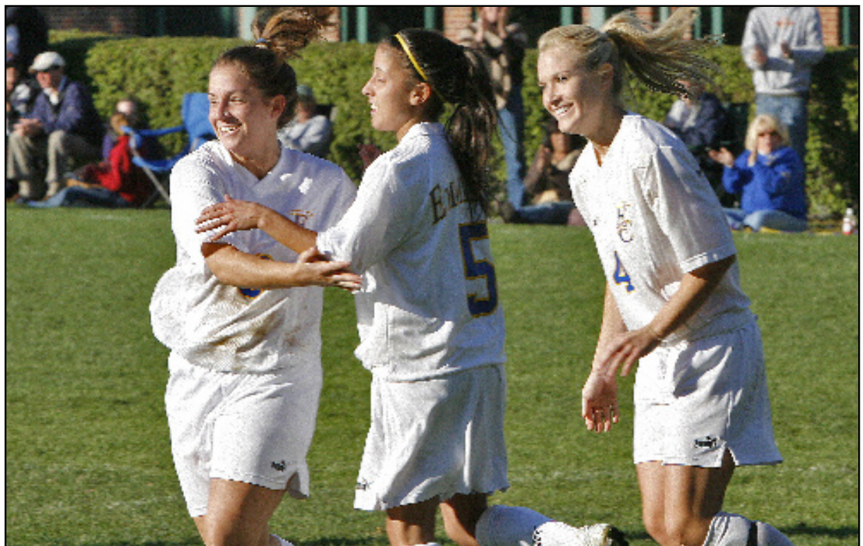
Members of the women's soccer team had much to celebrate after a record-breaking run this fall.