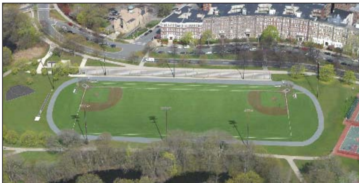
A rendering of the renovation to Clemente Field, which will be completed by the start of the 2009 academic year.