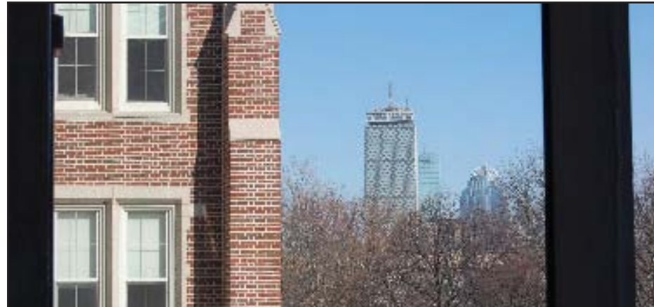
A view of Boston from inside the Academic Science Center.