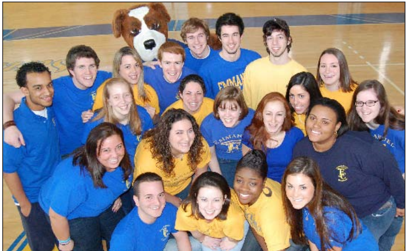
As the first student faces incoming classes see at Emmanuel, Orientation Leaders are key to helping new students adapt to college.

The Orientation Leaders themselves also recognize the role that they play in the new students' transition. As leaders, the Orientation team members take their jobs seriously and want to